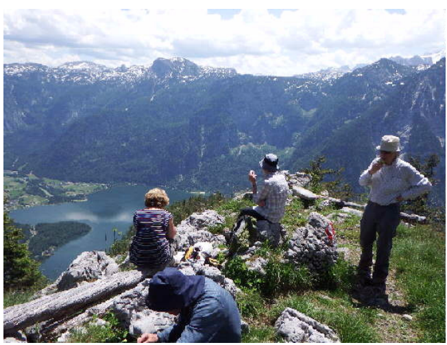
Hallstättersee from Schneidkogel