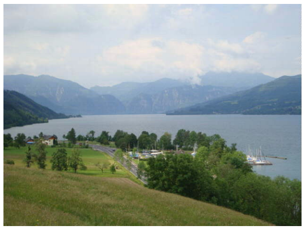
Southern Attersee, just before a downpour

The mine visit was a great tourist trap for a rainy afternoon. We finished the trip with an ascent of