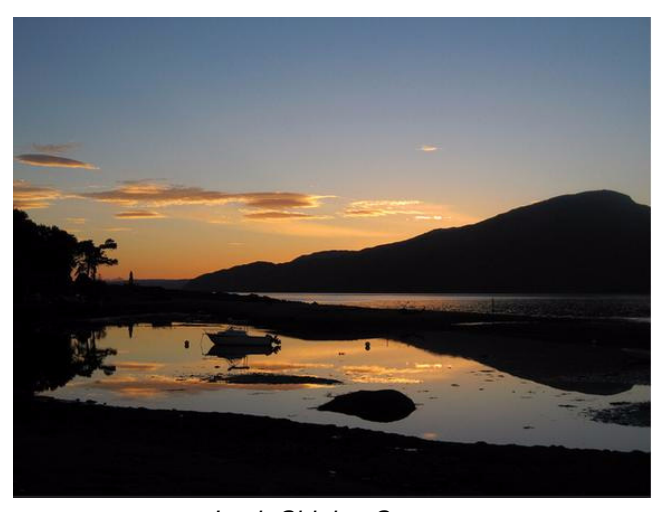
Loch Shiel at Sunset