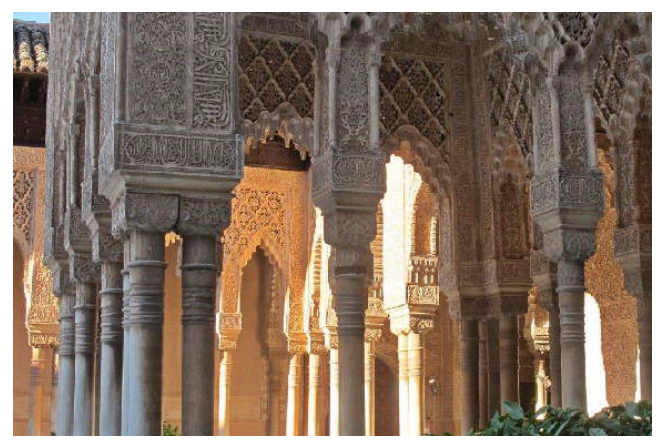
In the Alhambra