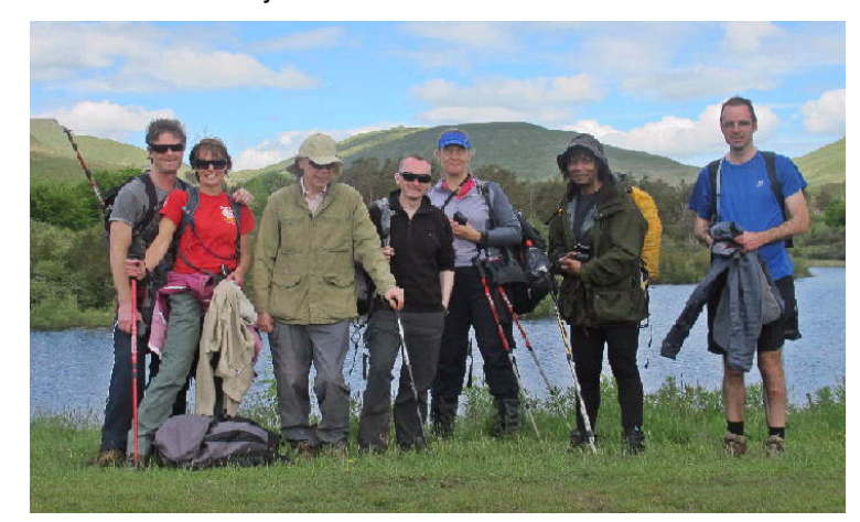
The gang by the Neuadd reservoir

bunkhouse that was in a nice location but rather lacking in some basic amenities (though it luckily had a very good drying room). The weather for the first two days was not great and limited the scope of the walks that were undertaken.