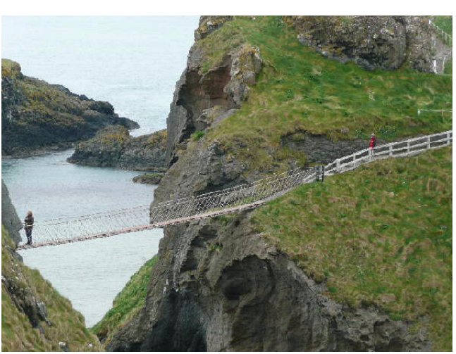
Carrick-A-Rede rope bridge