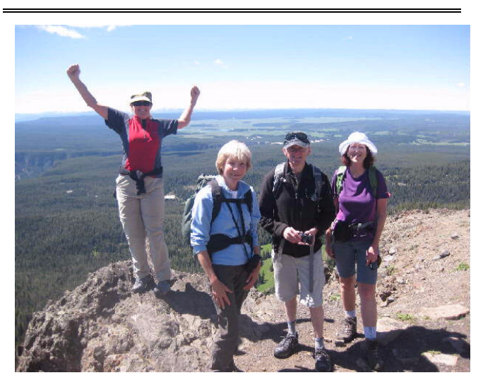
Congering Mount Washburn