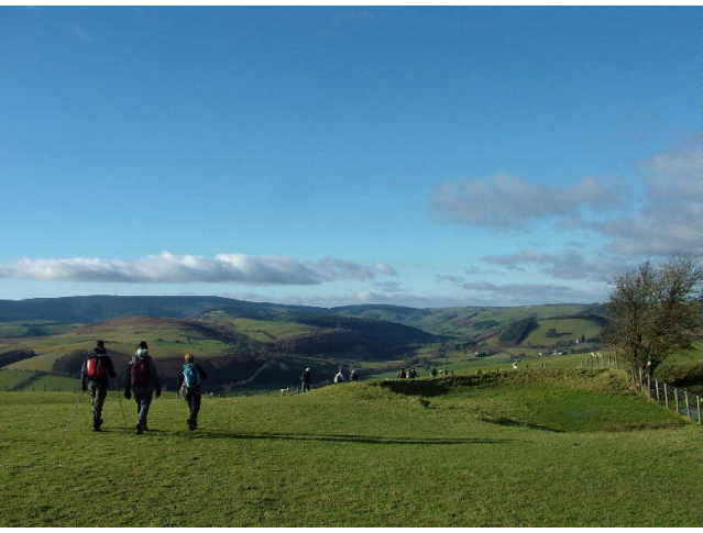
On Offa's Dyke path